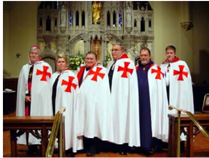
New Knights and Dames