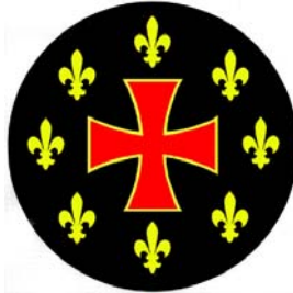
The Badge of the Priory of St. Bernard de Clairvaux