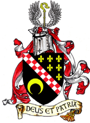
The Arms of the Priory of St. Bernard de Clairvaux New Orleans, Louisiana